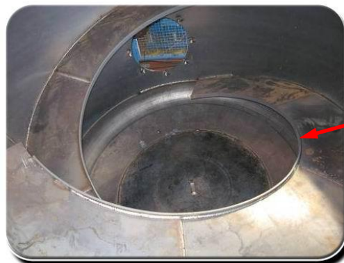
高耐磨T型条 High abrasion resistance T blade

The spiral mixer vanes which have CIFA “T” shape with wear-resisting technology can improve mixing capability and discharging speed, they also can prevent radial flaw, so service life of vanes is added 20%. And the application of special abrasion-resistant alloy steel increases the mixing drum’s service life by 60%~80%.