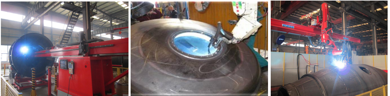
自动机器人焊接搅拌筒筒体 Manipulators solder the mixing drum

ZOOMLION has advanced machine such as pretreatment machining、plasma cutting machine、band sawing machine etc. and plate shears、folding machine、hydraulic machine、rounding machine; ZOOMLION has two fabricating & processing lines for mixing drums, the mixing drum is shaped by special machine, the cylindricity and taper of each part reach high precision to link with no gap. Manipulators solder the mixing drum automatically, technologic parameter of jointing is the best and changeless, that avoid the bug from person, and so mixing drums have better quality and capability. Two assembly lines for the concrete truck mixer are high-efficiency and energy-saving, so assembly quality can be assured.