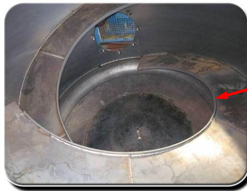
高耐磨T型条 High abrasion resistance T blade

The spiral mixer vanes which have CIFA “T” shape with wear-resisting technology can improve mixing capability and discharging speed, they also can prevent radial flaw, so service life of vanes is added 20%. And the application of special abrasion-resistant alloy steel increases the mixing drum’s service life by 60%~80%.